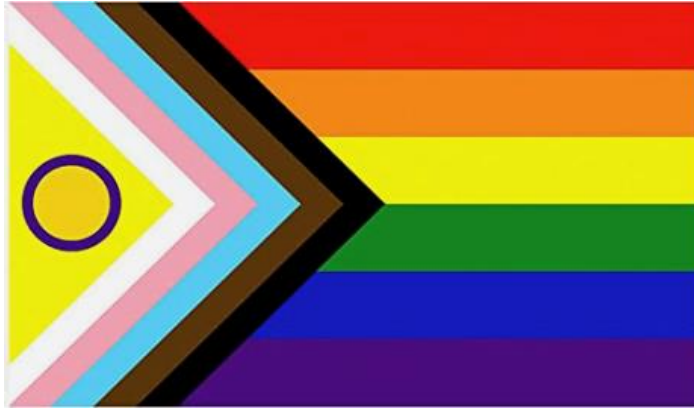
Intersex Progressive Pride Flag