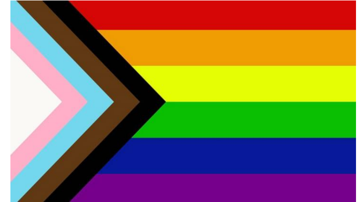
Progressive Pride Flag