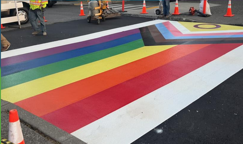
Pride Cross Walk- The City of Kirkland June Pride Month 2023